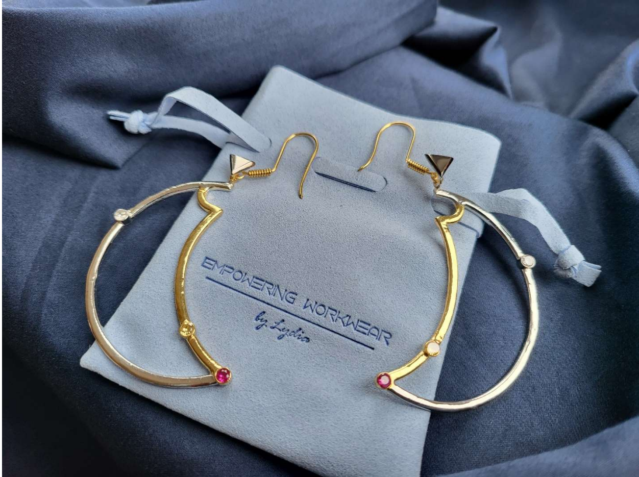
Empowering Workwear's Hypersonic Deterrence Earrings

Empowering Workwear announces the launch of Hypersonic Deterrence Earrings